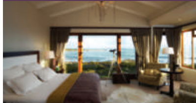
NEAR HERMANUS BEACH LOCATION