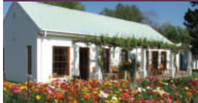
SWELLENDAM TOWN LOCATION